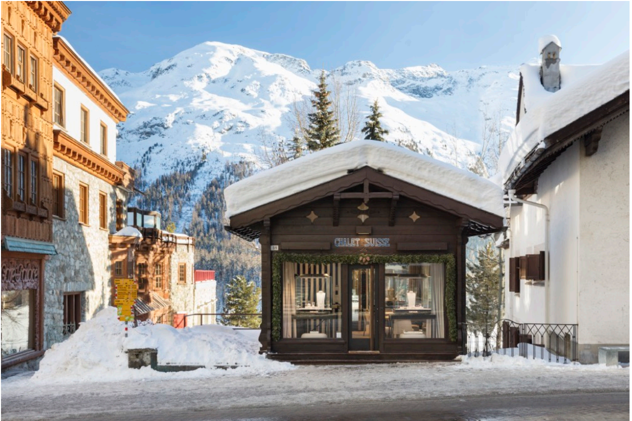
Gioielleria Remida Tornaghi via Serlas 31, St. Moritz