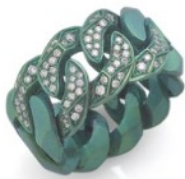
Rock Diamanti / Titanio Blu